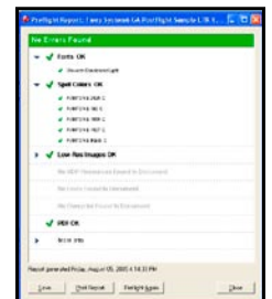
Generate a Preflight report to view and communicate potential problems before the job goes to print.

303 Velocity Way Foster City, CA 94404 [650] 357 3500 www.efi.com