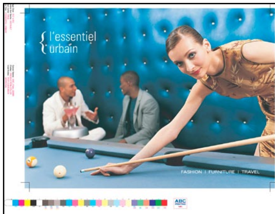
Add dynamic job information and customize the Control Bar.

Control Bar: Is highly customizable with fields to display job information and color control bar. Has the ability incorporate any EPS file.