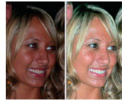
Image Enhance Visual Editor , a Command WorkStation plug-in, allows operators to make last-minute edits to a selected image without having to open the image in applications such as Adobe Photoshop®.