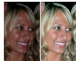
Image Enhance Visual Editor, a Command WorkStation plug-in, allows operators to make last-minute edits to a selected image without having to open it in applications such as Adobe Photoshop®.