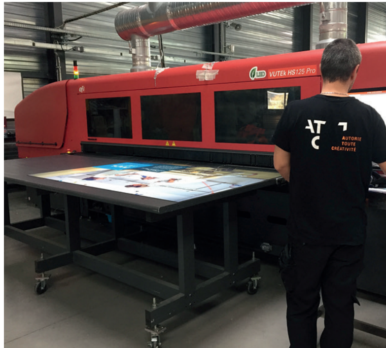
Operator in front of EFI VUTEk H125 Pro.