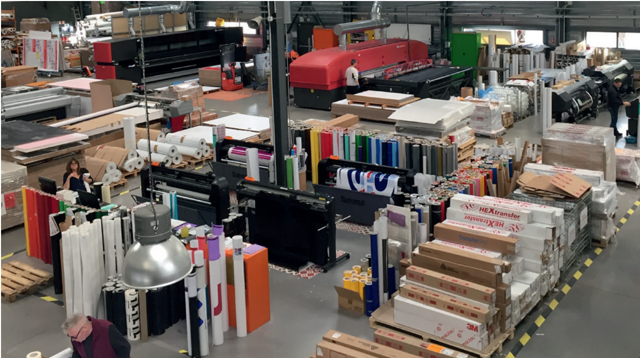
View of the facility.