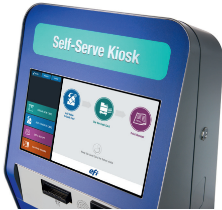
The large 48.3 cm multi-touch screen provides intuitive and easy cash-to-card user experience.