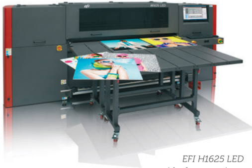
EFI H1625 LED wide-format printer

It's the perfect choice when image quality and turnaround are critical to meeting demands for traditional signage and display applications, as well as customized or specialty items.